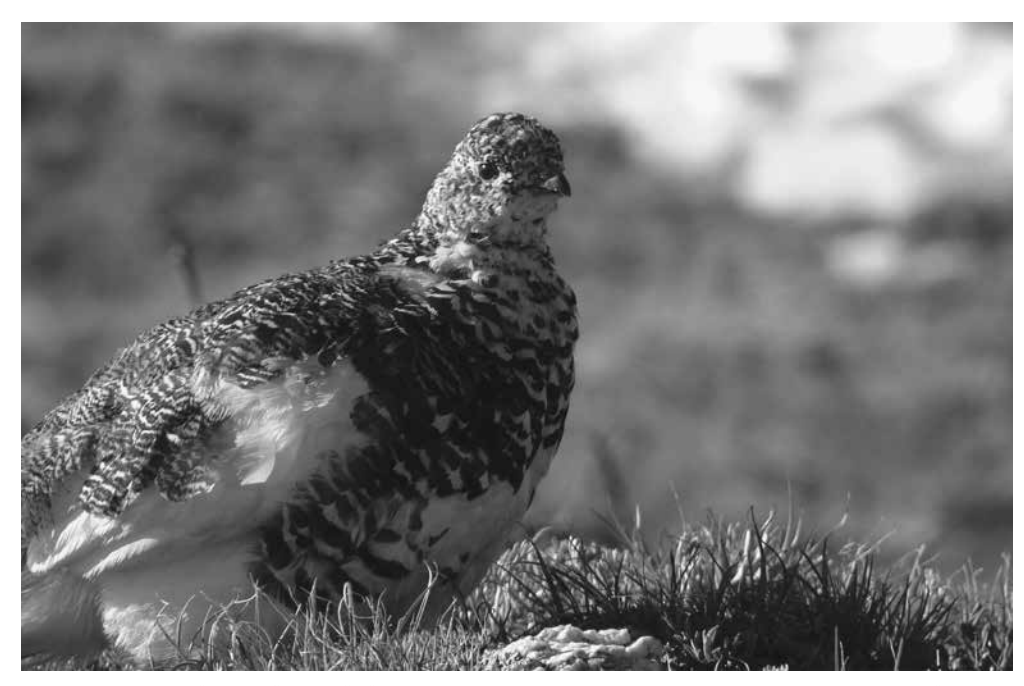
Figure 9.3. Southern white-tailed ptarmigan ( Lagopus leucura altipetens ) in summer plumage, Colorado, USA.

Environmental stochasticity driven by global climate change will require a greater focus on evolutionary potential and the study of adaptive variation in forecasting species responses. However, given the aforementioned challenges in identifying adaptive variation, attempts to predict evolutionary responses to climate change for species evaluated under the ESA have been mostly qualitative in nature. For example, the recent species status assessment for southern white-tailed ptarmigan ( Lagopus leucura altipetens , Figure 9.3)<sup>72</sup> incorporated results from two genomic studies that spanned the white-tailed ptarmigan distribution, identifying signatures of adaptive differentiation both within southern white-tailed ptarmigan and across the species complex.<sup>73</sup> In the southern subspecies, two of the three southern white-tailed ptarmigan populations (southern Colorado