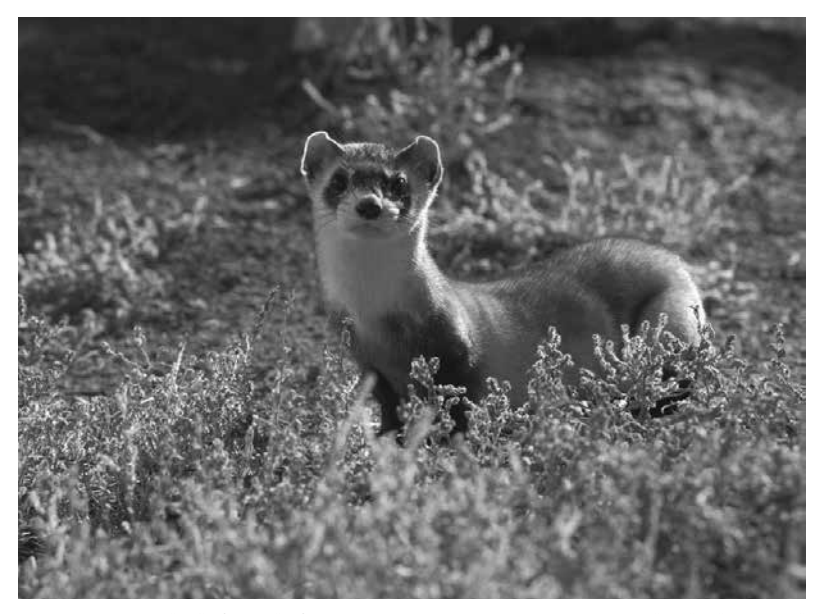
Figure 9.7. Black-footed ferret ( Mustela nigripes ), National Black-Footed Ferret Conservation Center, Carr, Colorado, USA.

Although ex situ programs were early adopters of genomics, applications in other areas of conservation practice are steadily becoming more commonplace and uptake into ESA