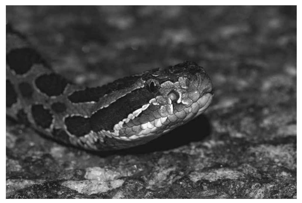
Figure 9.2. Eastern massasauga rattlesnake (Sistrurus catenatus), Parry Sound District, Ontario, Canada.

species range, as well as maintenance of the evolutionary processes that drive adaptive change, such as gene flow and selection.<sup>46</sup> In evaluations under the ESA, this link between historical and current conditions has often been established based on patterns and changes in species distribution and abundance, though genetic and genomic analyses are increasingly playing a role.