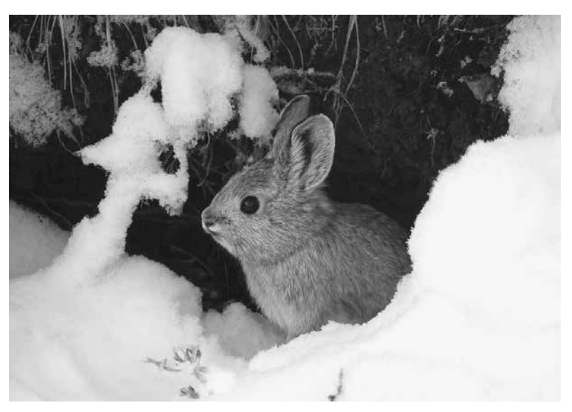
Figure 9.5. Columbia Basin pygmy rabbit (Brachylagus idahoensis).

to provide a working estimate of the ratio of effective-to-census population size, these authors recommend that the current delisting criteria be reevaluated, removing the reliance on effective size as the central criterion and expanding the analytical framework to incorporate both demographic and genetic factors.<sup>101</sup>