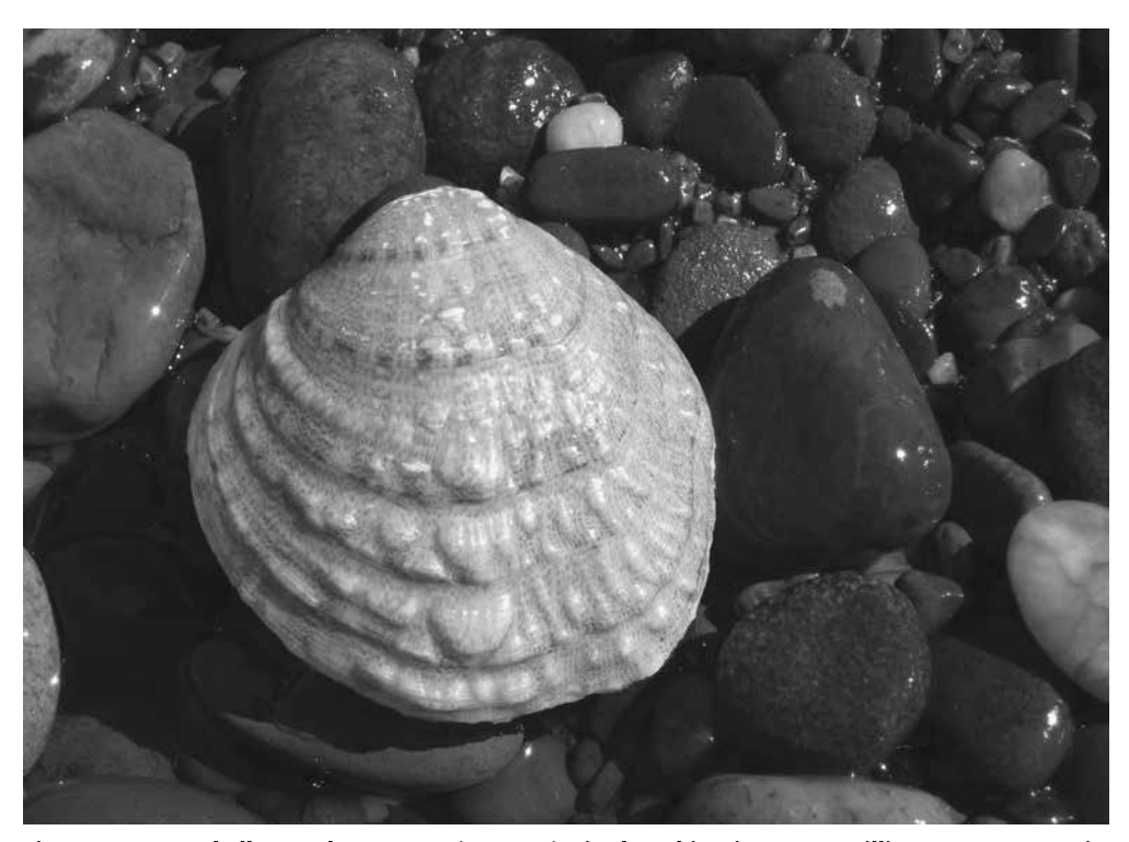
Figure 9.1. Fanshell mussel ( Cyprogenia stegaria ) in the Ohio River near Williamstown, West Virginia, USA.

The shift to genomics has heightened these concerns, since high resolution genomic data can be used to delineate fine-scale population structure, which could be interpreted as species-level divergence under some frameworks. Fortunately, genomic data also improve our ability to estimate demographic history and infer divergence, which can provide additional insight into the process of speciation and provide support for or against species-level divergence.<sup>16</sup> For example, genetic studies of the taxonomy of freshwater mussels in the genus Cyprogenia exhibited conflicting results based on a phylogenetic analysis using two mtDNA genes<sup>17</sup> and a study of population structure using one mtDNA gene and ten nuclear microsatellite markers.<sup>18</sup> Resolving the taxonomy of this group is important, since it currently includes one ESA-listed endangered species ( C. stegaria , Figure 9.1) and a second species proposed as threatened ( C. aberti ). A recent study